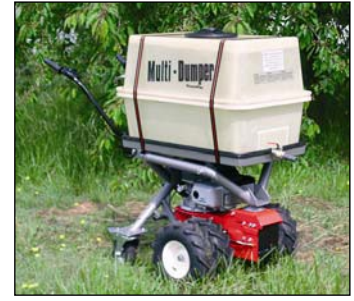
Tank 200 ltr./ 53 gal, acid proof