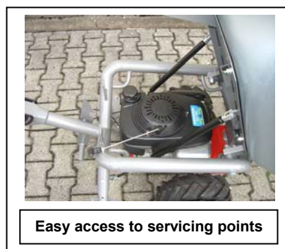
Easy access to servicing points