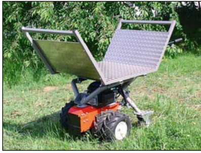
Wood carrying basket