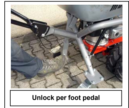
Unlock per foot pedal