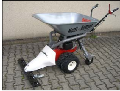
Sickle bar mower